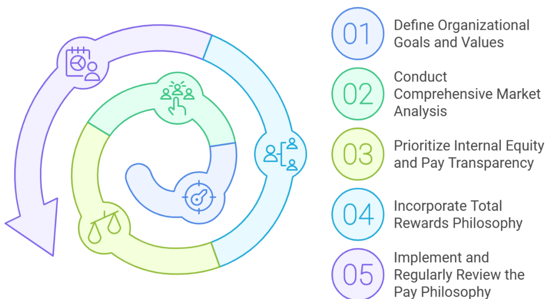
Proposed Approach to Designing Pay Philosophies

Integrate the pay philosophy into HR policies and ensure leadership buy-in. Regularly review and update benchmarking data to reflect evolving market conditions and workforce dynamics. This ensures the organization remains agile and competitive while maintaining financial sustainability.